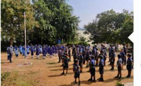
CUBS AND BULBULS ACTIVITIES